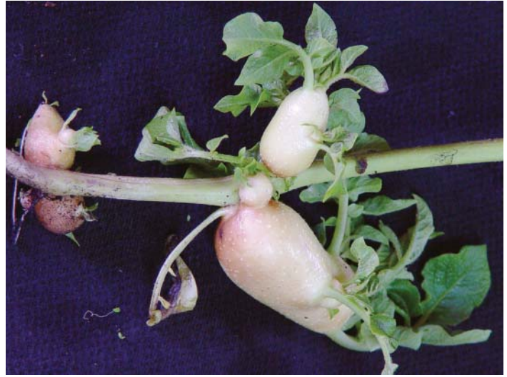
Figure 4. Small aerial tubers may form aboveground if stolons and underground stems are severely infected.

Poor stands may also be mistaken for seed tuber decay caused by Fusarium or soft rot bacteria unless plants are dug up and examined. Rhizoctonia does not cause seed decay, damaging only sprouts and stolons. Poor stands and stunted plants can also be caused by blackleg, a bacterial disease that originates from seed tubers and progresses up stems, causing a wet, sometimes slimy rot. In contrast,