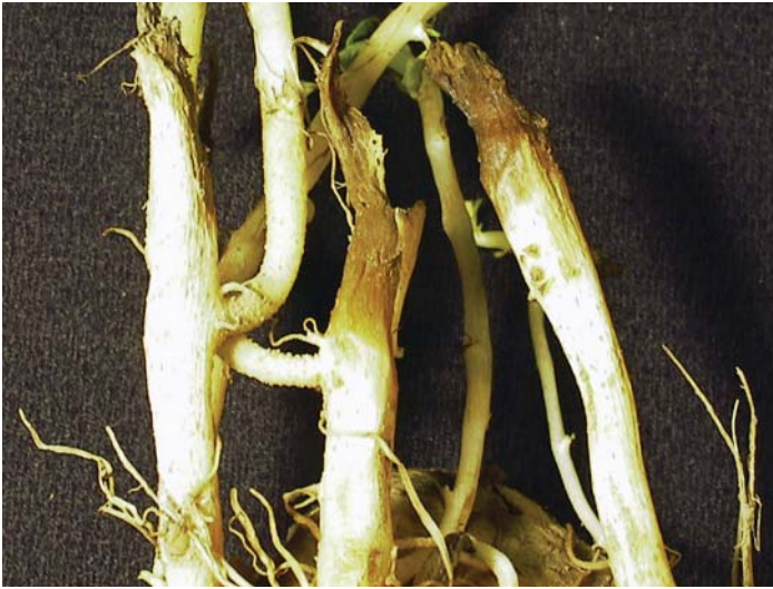
Figure 3. Germinating sprouts may be killed by R. solani before they emerge from the soil.

are superficial and irregularly shaped, ranging from small, flat, barely visible blotches to large, raised lumps. Although these structures adhere tightly to the tuber skin, they do not penetrate or damage the tuber, even in storage. However, they will perpetuate the disease, and if infected tubers are used as seed, inhibit the establishment of potato plants.