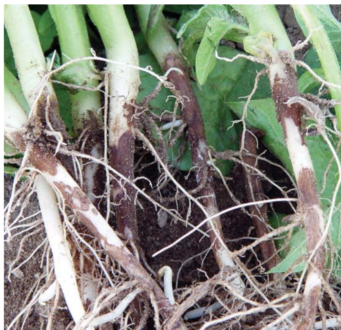
Figure 2. Brown, sunken lesions on underground stems and stolons are caused by R. solani .

The symptoms of the disease are found on both above- and belowground portions of the plant. Black scurf (Fig. 1) is the most conspicuous sign of Rhizoctonia disease. In this phase of the disease, the fungus forms dark brown to black, hard masses on the surface of the tuber. These are called sclerotia and are resting bodies of the fungus (Fig. 1). Sclerotia