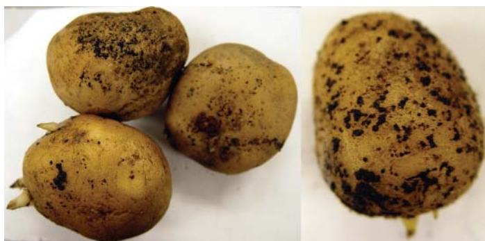
Figure 1. Rhizoctonia solani sclerotia on the surface of tubers.

In Michigan, R. solani causes black scurf on tubers (Fig. 1) and stem and stolon canker on underground stems and stolons (Fig. 2), and it occurs wherever