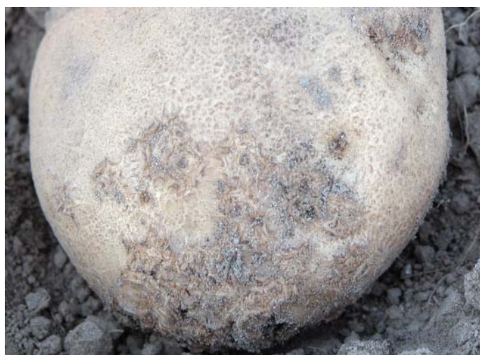
Figure 1. A tuber infected with common scab. Corklike lesions form on the surface of the tuber.

Of the more than 400 identified species in the genus Streptomyces , only a fraction are considered plant pathogenic. Common scab may be caused by several soil-dwelling plant pathogenic bacterial species in this genus, including S. scabies and S. turgidiscabies . In particular, S. scabies has been well documented in causing scab lesions. Streptomyces scabies infects a number of root crops, including radish ( Raphanus sativus ), parsnip ( Pastinaca sativa ), beet ( Beta vulgaris ) and carrot ( Daucus carota ), as well as potato ( Solanum tuberosum ). The disease occurs worldwide wherever potatoes are grown. Common scab does not usually affect total yields, but the marketplace for potatoes is quality driven, so the presence of scab lesions, especially those that are pitted, significantly lessens the marketability of both tablestock and processing varieties.