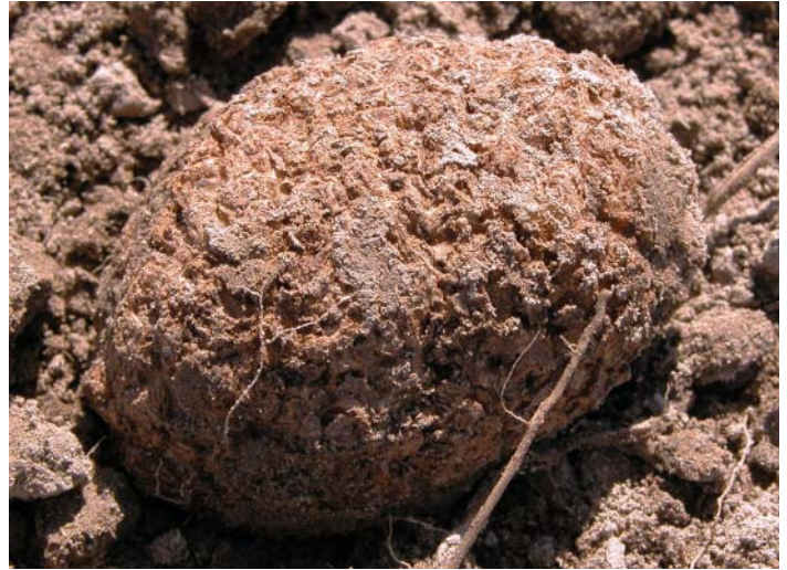
Figure 4. In severe cases of common scab, lesions may cover the entire surface of the tuber.

The optimum temperature for infection of potato tubers by S. scabies is 68° to 72°F, but the pathogen