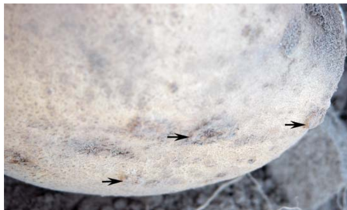
Figure 2. A tuber infected with common scab. The disease may form raised corklike lesions on the surface of the tuber (arrows).

Scab symptoms are usually first noticed late in the growing season or at harvest. Tubers are susceptible to infection as soon as they are formed. Lesions start out as small brownish spots, which enlarge into water-soaked circular lesions within a few weeks of infection. These circular lesions may coalesce, forming large scabby areas (Fig. 3). Scab is most severe when tubers develop under warm, dry soil conditions with a soil pH above 5.2 (Fig. 4). Common