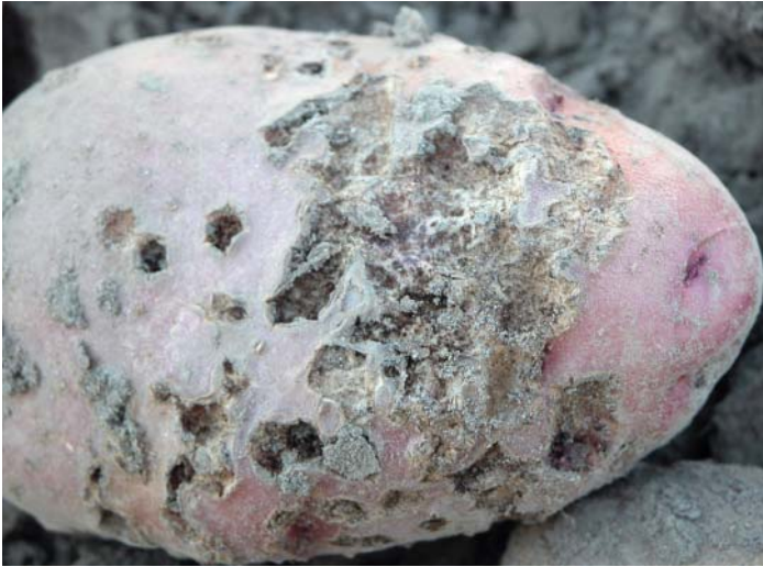
Figure 3. Along with surface and raised corklike lesions, common scab may form pitted lesions, which may be 3 to 4 mm deep.

scab is greatly suppressed in soils with a pH of 5.2 or lower. However, tubers grown in acidic soil may develop scablike lesions. These may be due to acid scab, a similar disease to common scab caused by the related pathogen S. acidiscabies . The acid scab pathogen can grow in soils with a pH as low as 4.0. Acid scab and common scab are hard to differentiate - lesions caused by S. acidiscabies are similar to those caused by S. scabies .